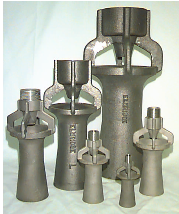
Nozzle Steam Capacities (lb/hr) and Time (secX100) Required to Raise the Temperature of One Gallon of water by One Degree F for SE Series Gas-Jet Steam Spargers

ELMRIDGE 'SE Series' Gas-Jet Steam Spargers are used for heating liquids where steam can be directly injected into vented vessels and tanks. The venturi design of these Steam Spargers provides superior injection performance due to the capability of the Sparger to aggressively circulate tank contents, reducing or eliminating thermal gradients. ELMRIDGE 'SE Series' Gas-Jet Steam Spargers operate on the same basis as our standard line of steam-powered Jet-Apparatus, whereby steam emerges from the Sparger nozzle at high velocity, creating a zone of lower pressure. Tank contents are drawn to this lower pressure zone, where the momentum of the steam is transferred to the liquid, causing the liquid to be 'pumped' as well as heated. Operating characteristics (Sat. Steam / Water), for standard models are shown below, and special units are also available to meet your specifications. Standard materials of construction are Cast Iron, 316 Stainless Steel, Alloy 20, and Hastelloy C®. Other materials are available upon request. Threaded, flanged, or socket weld connections (except Cast Iron).